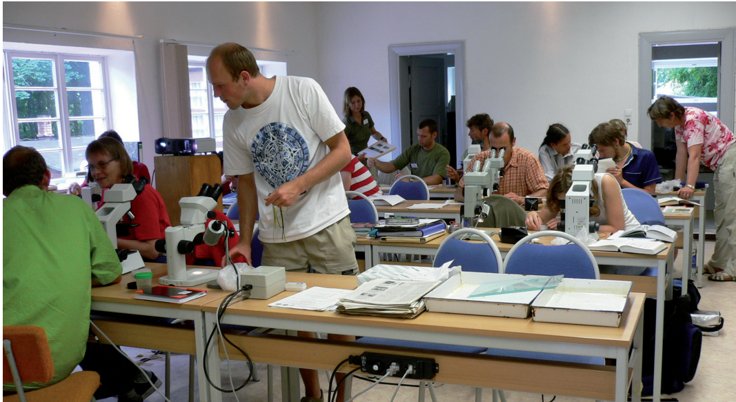
Fig. 2: Participants of the workshop „Monitoring methods of macrophytes, part 2: soft bottom monitoring“ in the laboratory classroom of the Hiddensee Biological Station